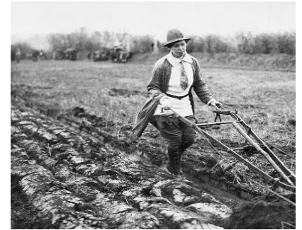
A member of the women's land army in the First World War